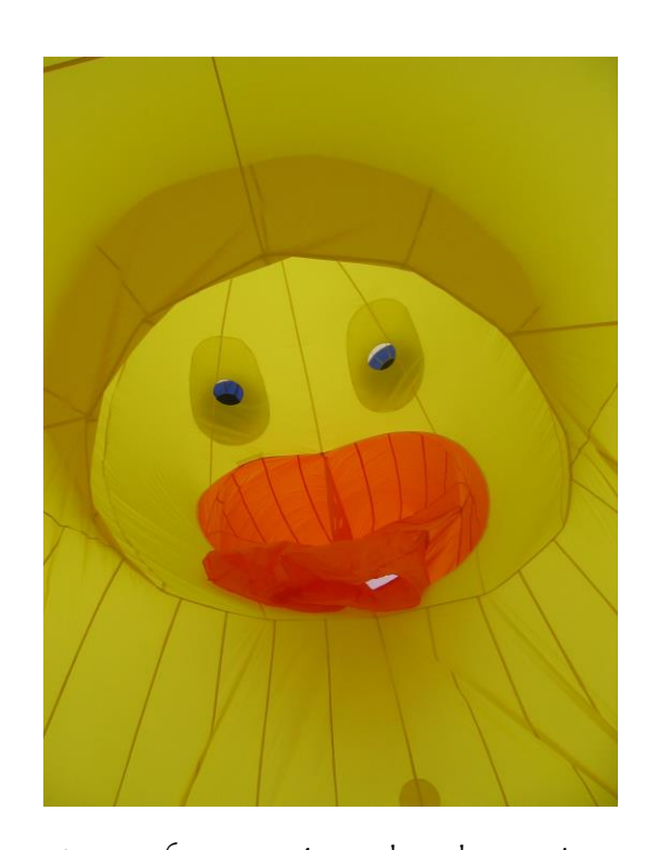
A view from inside "What the Duck"