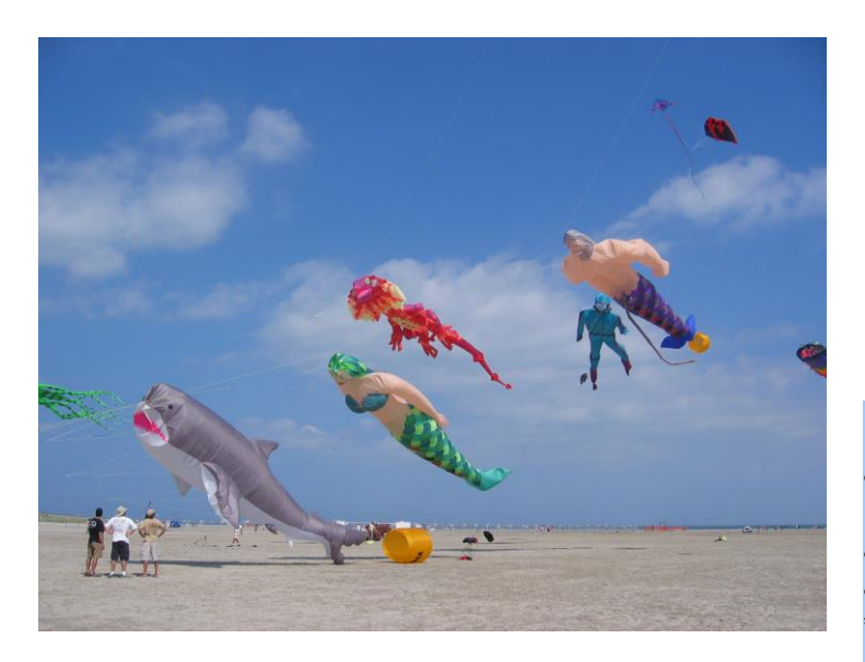
The Greater Wildwoods Tourism Improvement & Development Authority and the City of Wildwood welcomes you to come and fly on the beautiful beaches along our famous boardwalk!